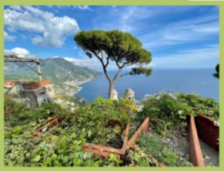
A Taste of Italy: Food, Culture, and Health (Summer)