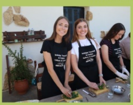
Eating, Cooking, and Living the Mediterranean Way: Greek Islands (Spring)

Zoom link: <a href="https://byu.zoom.us/j/91436379965">https://byu.zoom.us/j/91436379965</a> or QR Code More info: randy_page@byu.edu