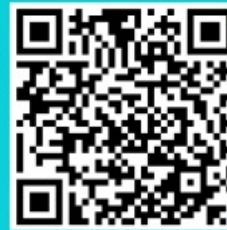
QR Code to First Survey

If you are interested in participating, please fill out the survey at the QR code above or at this link: https://byu.az1.qualtrics.com/jfe/form/SV_0HxNNjmx8yrFdhc